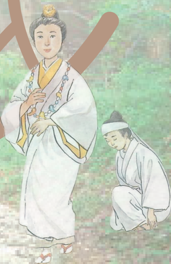
Gusuku Sites and Related Properties of the Kingdom of Ryukyu