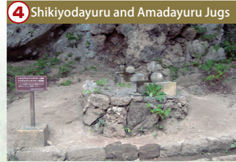
4 Shikiyodayuru and Amadayuru Jugs

The two jugs are placed to collect the "holy water" dripping from the two stalactites above.